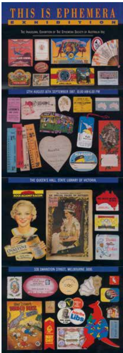
Two Ephemera Society posters promoting ephemera exhibitions.

Devoted to the preservation, study and display of items of a transient nature. For the latest news head to ephemerasyociety.org.au and follow us on Facebook